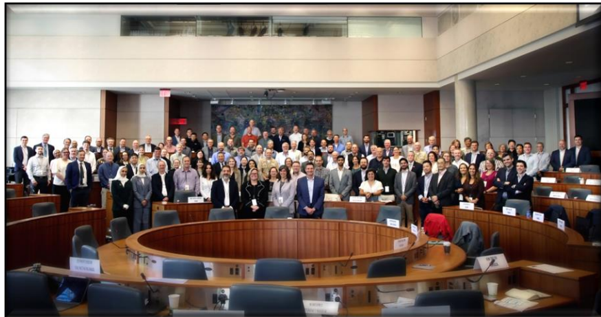
35 th IRSO group photograph