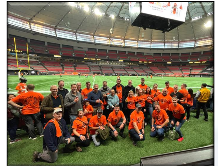
Team-building and social activities at BC Place Stadium