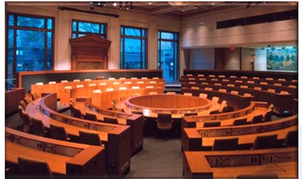
Simon Fraser University – Morris J. Wosk Centre for Dialogue

40 participants from the private sector , including shipyard representatives, ship designers, vessel equipment suppliers and scientific sensor developers, had the opportunity to showcase new trends and innovations in vessel design and equipment .