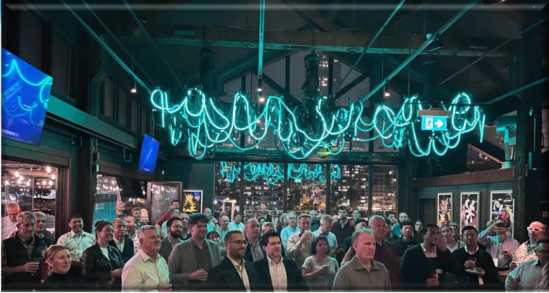
35 th IRSO Icebreaker